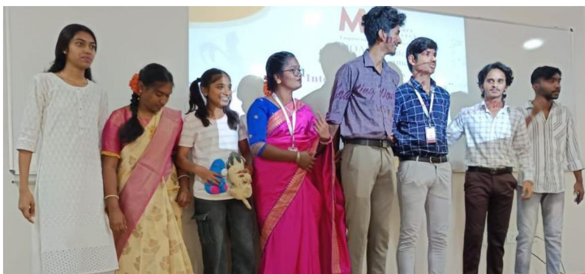
(Students group photo after the short performance)

The highlight of the event was an engaging and thought-provoking skit, which showcased real-life scenarios of women's struggles and triumphs. The performance resonated with the audience, delivering a strong message of resilience, strength, and determination.