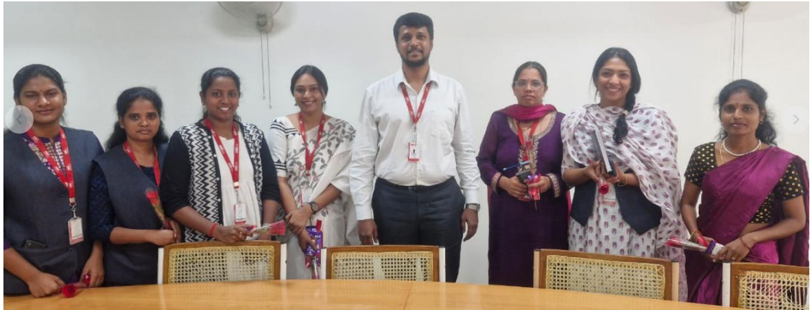
(Principal wishes to female faculty with bouquet of flower & chocolates)

The Women's Day celebration began with the principal presenting bouquets of flowers and chocolates to the female faculty members, followed by a photo session and the distribution of well wishes for a Happy Women's Day.