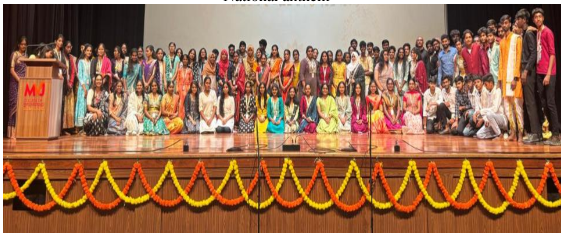
Participants Group Photo