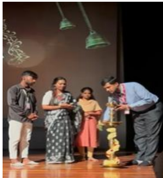
Lighting of the lamp by the principal & Principal talk