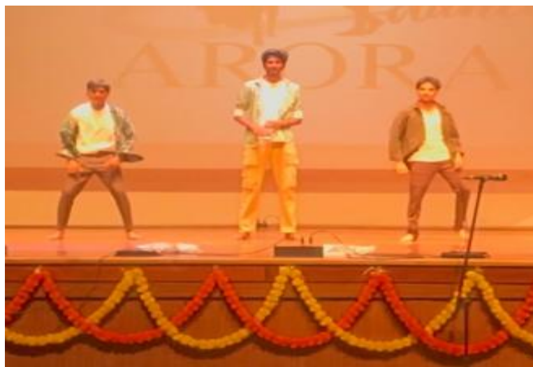
BBA & BCA students dance performance

The Group Dance Competition was one of the most electrifying events of Cultura Nova 1.0, filling the stage with energy, rhythm, and vibrant performances. Each team showcased synchronized moves, creative choreography, and expressive storytelling through their dance forms. The competition featured a mix of classical, folk, contemporary, hip-hop, and fusion dance styles, reflecting the diversity of cultures and artistic expression. The performers displayed coordination, stage presence, and high-energy execution, leaving the audience mesmerized.