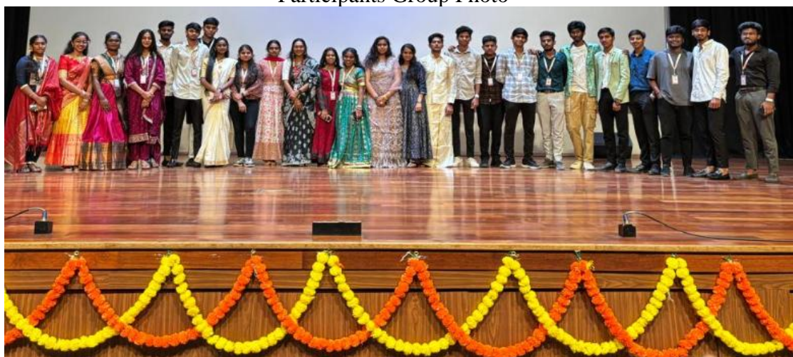
Cultural Club Group Photo