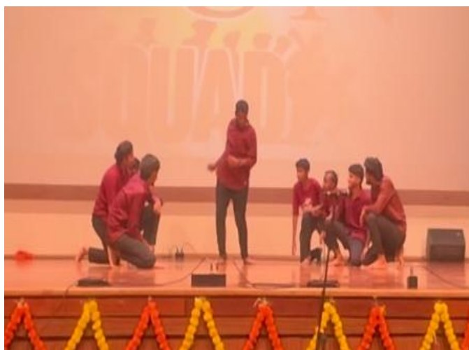
B.com Students performing the comedy drama

The Drama segment of Cultura Nova 1.0 was one of the most thought-provoking and engaging events of the festival. Participants took the stage with powerful performances that blended emotions, storytelling, and creativity, leaving the audience captivated. The actors demonstrated excellent dialogue delivery, expressive body language, and seamless stage coordination.