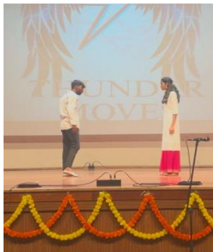
BBA student drama