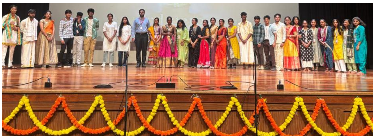
Group Photo of the participants after the performance

The "Echoes and Beats: The battle of speech and dance" event was one of the most vibrant and visually stunning segments of Cultura Nova 1.0. The students represented each state with the dance and spoke about the state. A culture dance performance is a beautiful way to represent the rich traditions, diversity, and heritage of different societies.