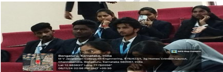
Students at Club Log release