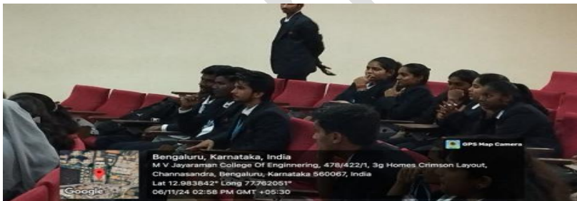
Participants of Business Quiz

Round 1 - Business Quiz: The event kicked off with a competitive Business Quiz, testing participants' knowledge of business concepts, current affairs, and corporate history. This round served as an elimination stage, narrowing down the participants based on their scores.