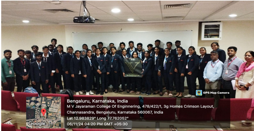
Management club members